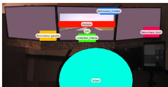
Figure 2: Spatial representation of the areas of interest on the reference image of the participants' full visual field.

The fixations in the far forward area represent an attention disengagement fixation area: 1 AOI - "Horizon".